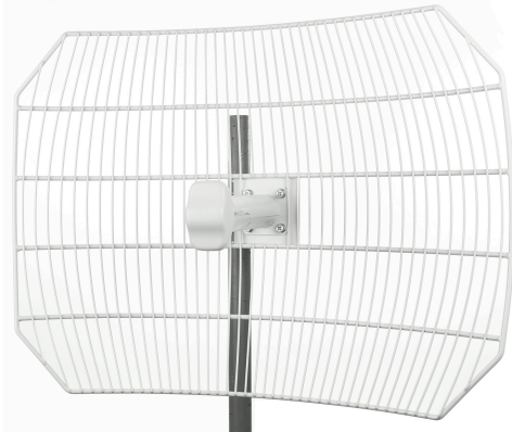
17"x24", 20dBi Antenna